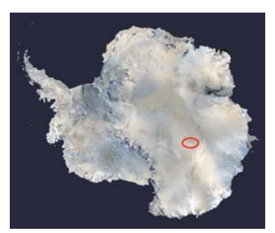
Figure 2: Location of Vostok Lake

Lake Vostok is the largest of the subglacial lakes, measuring 225 kilometers long, and 50 kilometers wide, which makes it about the size of Lake Ontario. It is also very deep, reaching a maximum depth of a little under 3,000 feet, containing